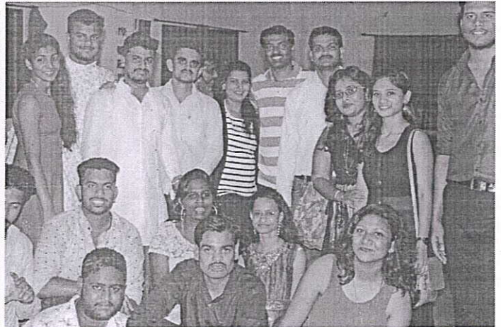
Snapshot 2: MBA-II and MCA-III Students