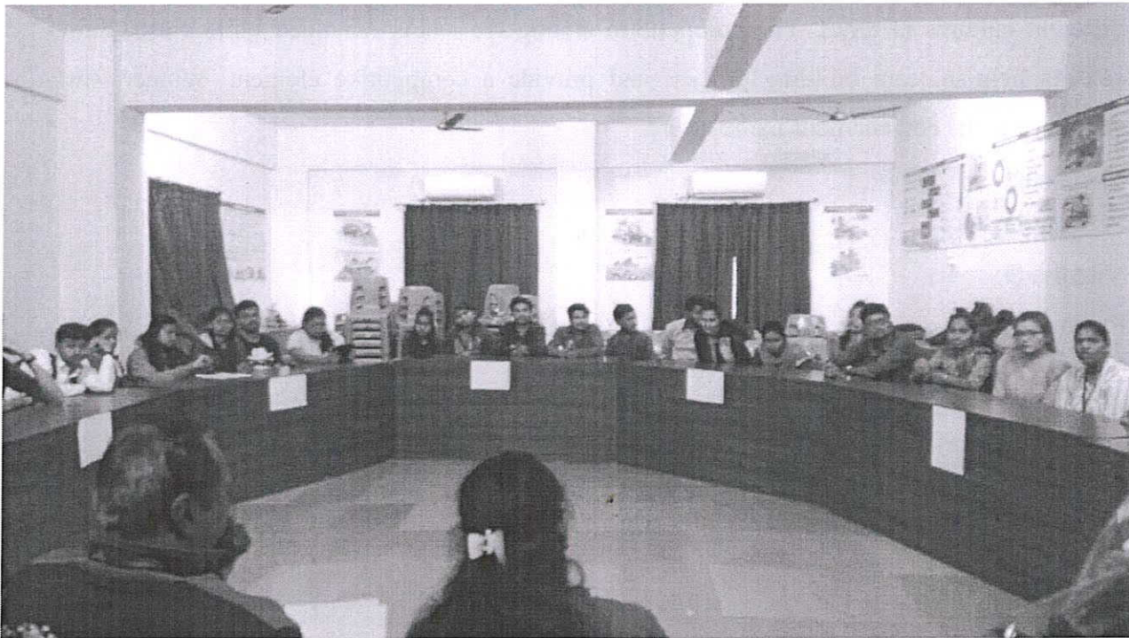
Snapshot 1: Students of MBA and MCA