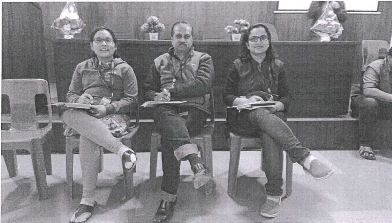
Snapshot 2: Faculty members as judges of competition